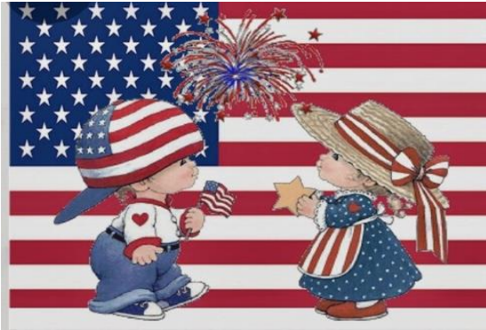
Kids are never too young to teach Patriotism