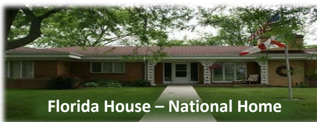
Florida House – National Home

VFW NATIONAL HOME FOR CHILDREN HELP HOPE HONOR